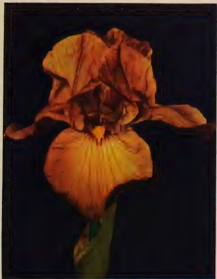
Tobacco Road—$6.00 (Page 10)